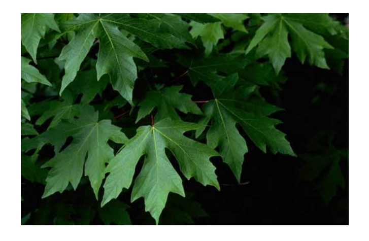
These trees can be seen throughout the <u>Hoh Rainforest</u> in <u>Olympic National Park</u>, besides various locations throughout Seattle.