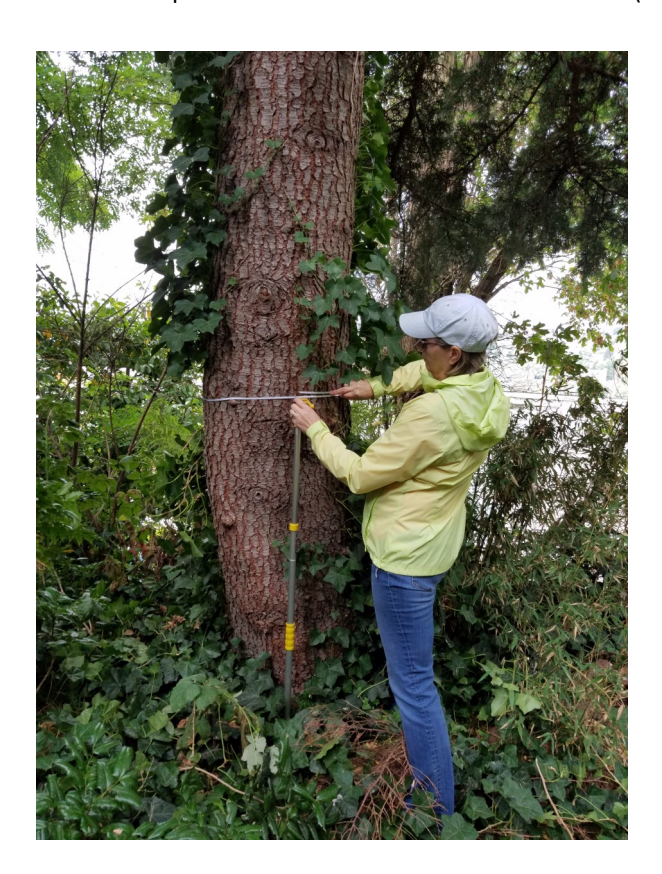
10.) Robinia pseudoacacia — black locust (Corrected species): 18" DBH, 25' Tall, 18' Drip line.Not Exceptional (30" Threshold.)